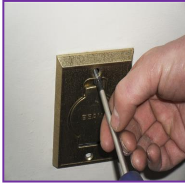
2. Unscrew old inlet from wall