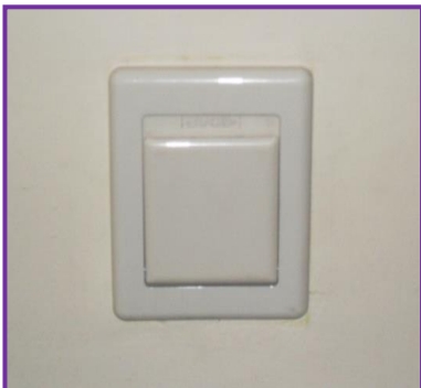
7. Plumb inlet, tighten screws and fit inlet trim