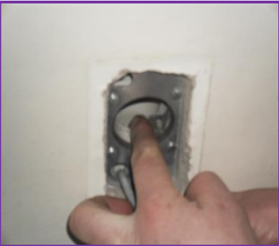
4. Clean around the wall port