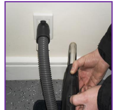
9. Test the inlet is working correctly and ensure no leaks

Should problems persist with your inlet, please do not hesitate to contact us by calling +44(0)28 7963 2424 or email info@beamcentralsystems.com