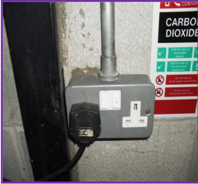
1. Switch main power unit supply off