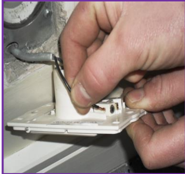
5. Reattach LV cables from old inlet