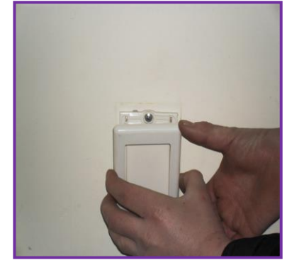
6. Position inlet into port and secure loosely with screws